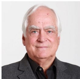
Peter Eigen Founder Transparency International

Dr. Peter Eigen has worked in economic development and governance for several decades and has led initiatives for better global governance and the fight against corruption.